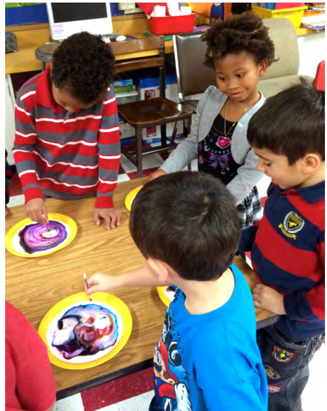
Changing the color of milk with dishwashing liquid while learning about chemical bonds in Cool Chemistry.